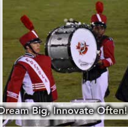
Dream Big, Innovate Often!